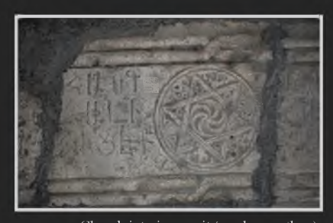
Church interior, gavit (used as narthex): marble tombstone of Hasan Jalal Vahtangian